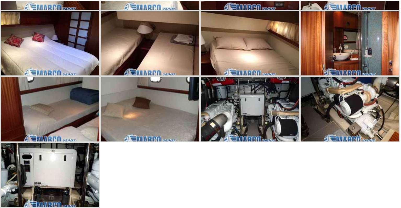
Cantieri estensi Maine 530