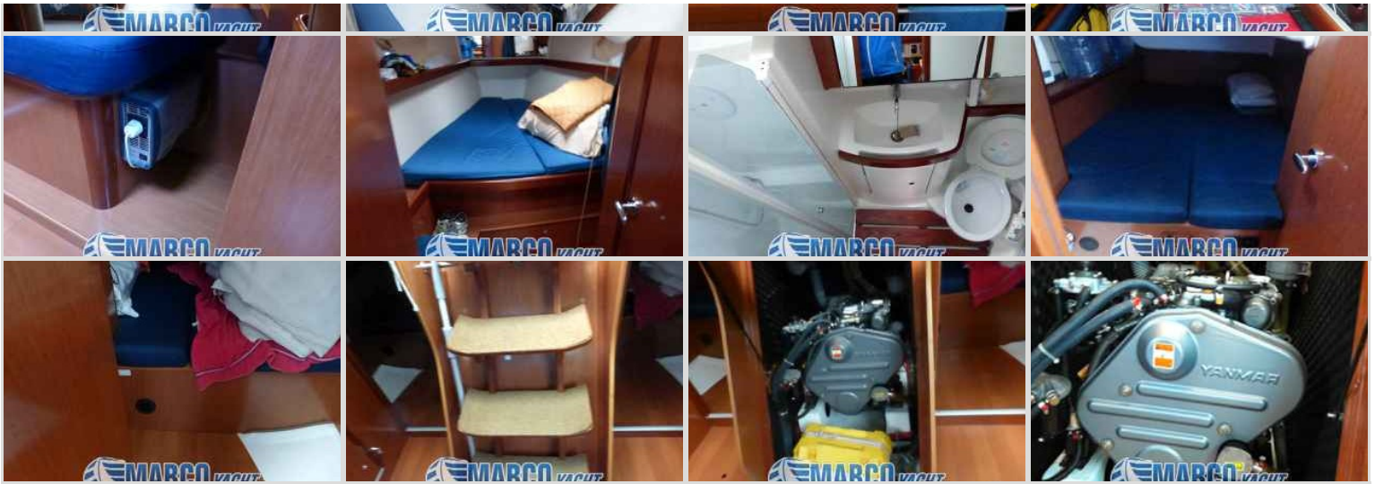
Beneteau Oceanis 43