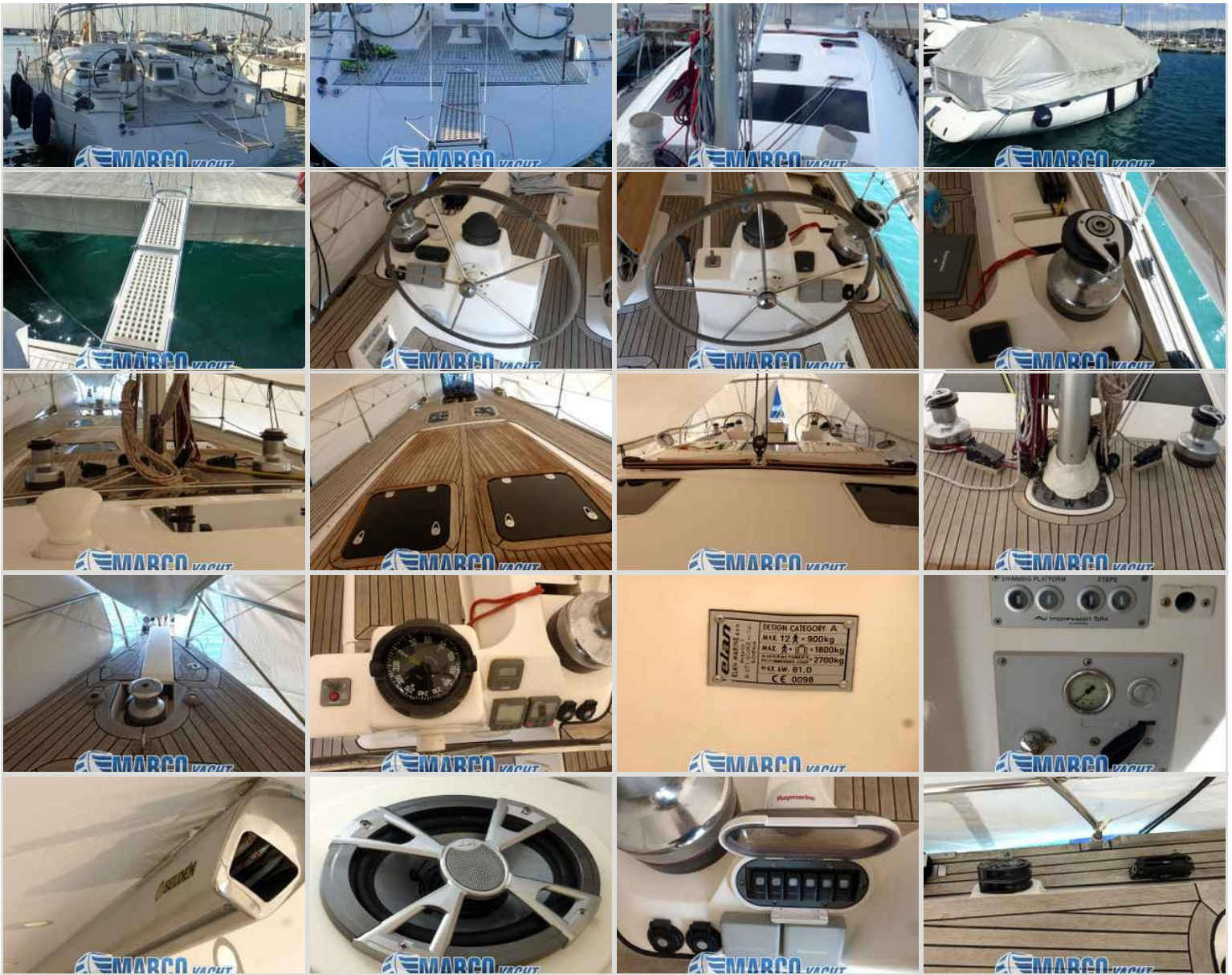
Elan 514 impression